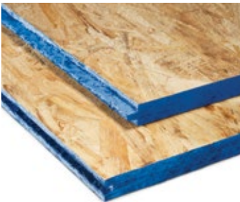
T-STRAND OSB Products T&G/Square Edge