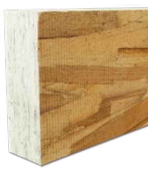
T-TEC LSL Laminated Strand Lumber