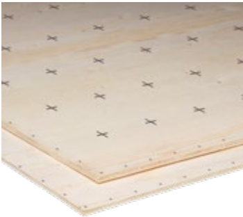
T-PLY Plywood Products T&G/Square Edge