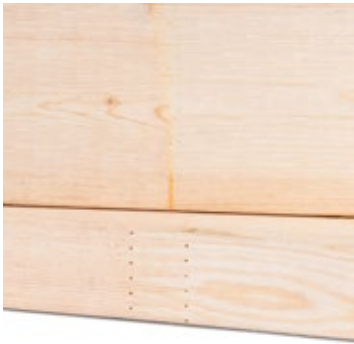
WESTERN SPF Finger Joint Studs