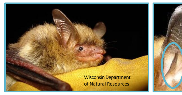
Long ears are ~ 17mm, and extend beyond nose Tragus (cartilage flap) is ~10mm, long and slender